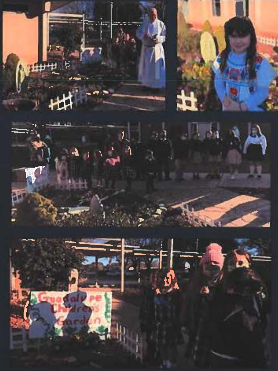
Blessing of the Guadalupe Children's Garden

To see more photos visit facebook.com/StJosephCatholicSchoolAnderson